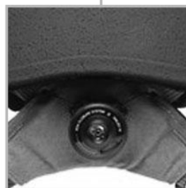
BOA Dial Harness