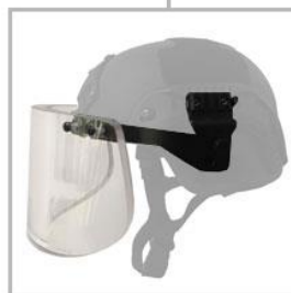
Ballistic / Fragment Visor Fitted / Retro-Fit / Rail fit