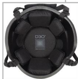
D30 Pad System